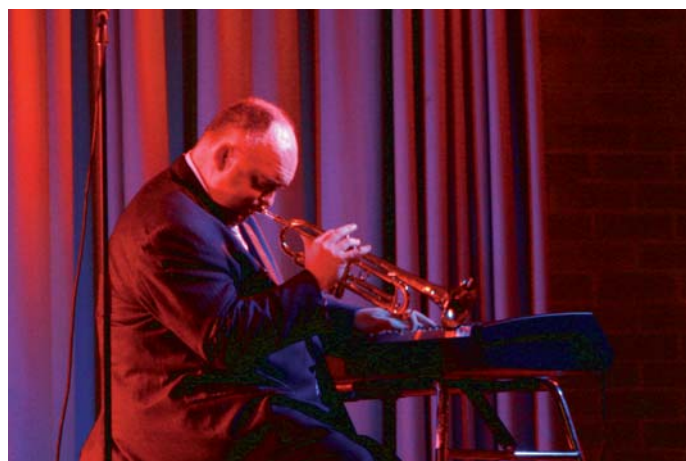
James Morrison and his sextet wowed audiences with a fantastic jazz concert as part of the Woodend Winter Arts Festival. James accompanied himself in this instance — on trumpet and piano at the same time!