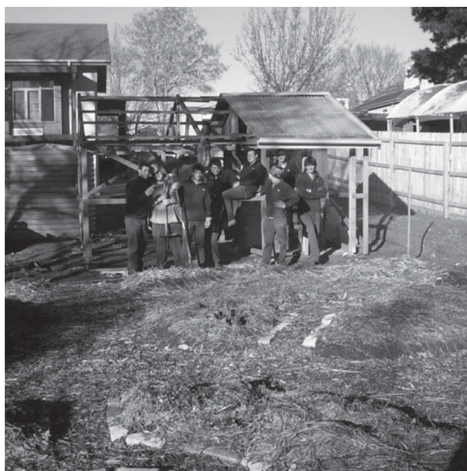
The Green Corps Team celebrating the completion of the mud brick walls.