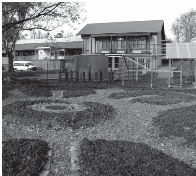
Keyhole circular garden beds completed at the project site.

Finally, a big part of the Green Corps program is to plan and implement a 'community venture'. The team have decided to raise much needed funds for the Woodend Sustainable Living Community in order to get materials to finish the community permaculture garden. They will be hosting a Saturday sausage sizzle in Woodend as well as a trivia night at the local Woodend Community Centre on Friday the 25th of July. Members of the public who are keen to support our project are most welcome to attend. Please call Kim or Mandie on 0407 686 289 for more information and tickets for the trivia night.